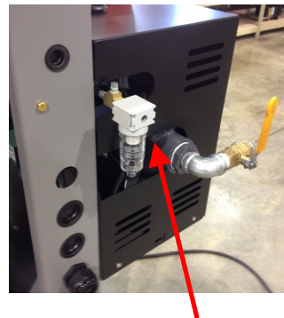
Incoming Air Connection 1/8" NPT Thread