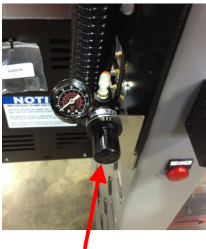
Air Pressure Regulator