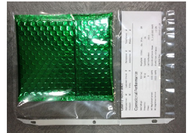
Operating Manual and Drawings

The manual is shipped with the unit in electronic format wrapped in a green bubble wrap mailer within the Accessories Box. In the manual is an extensive step by step process of how to assemble the enclosure and attach it to the unit.