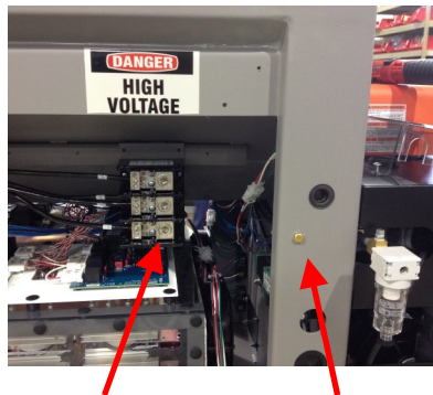
Incoming Power Connection Chassis Ground Connection