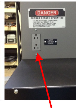
120VAC receptacle for pump